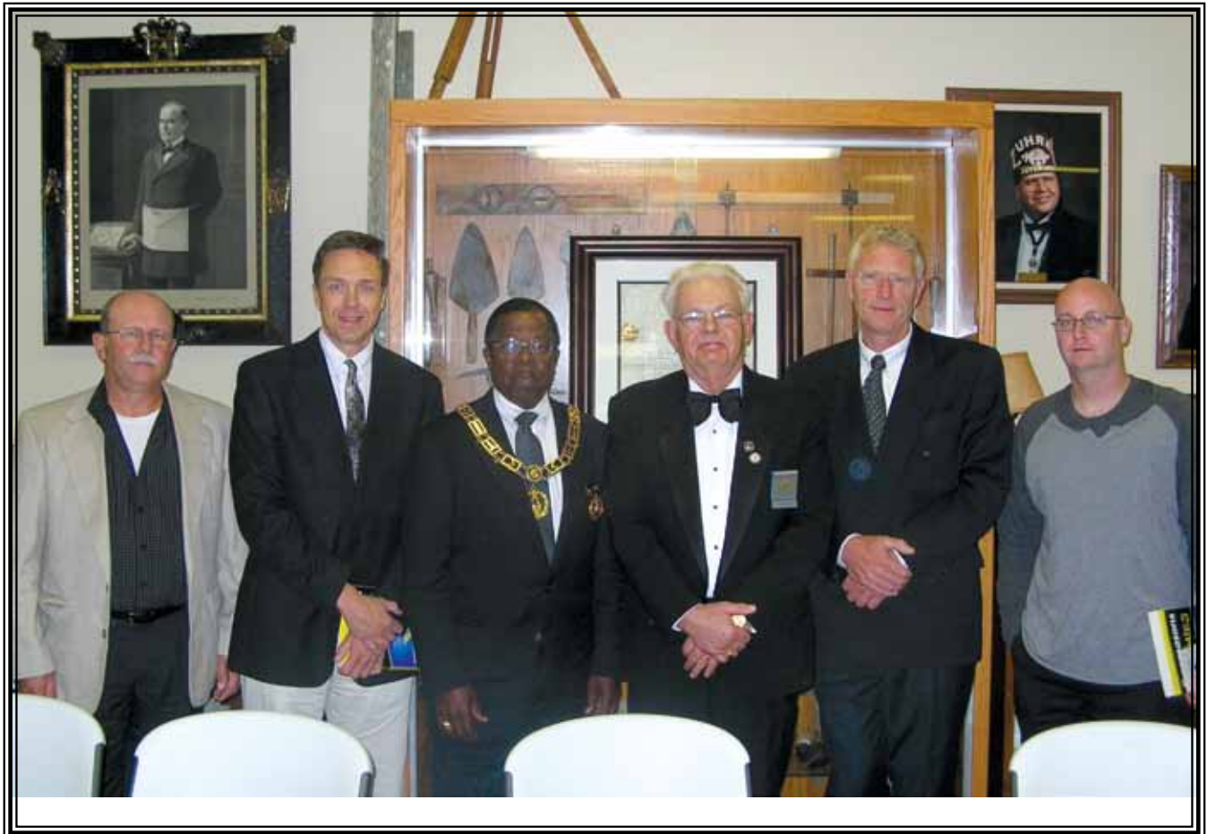
MWGM Cook welcomes Anoka's new Entered Apprentices at September Table Lodge