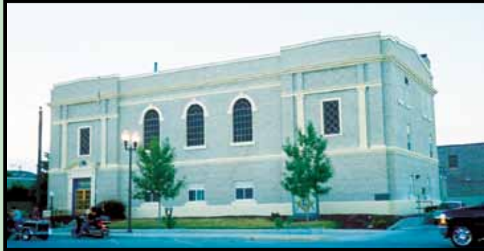
Mt. Rushmore #220, Rapid City, SD