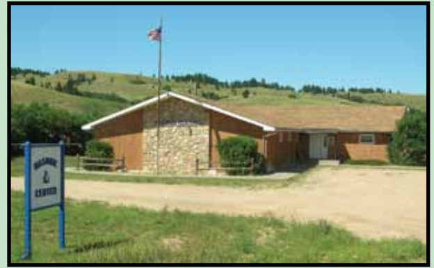
Olive Branch Lodge #47, Sturgis, SD