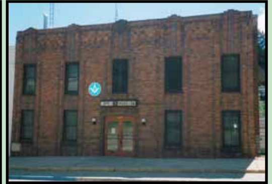
Golden Star #9, Lead, SD