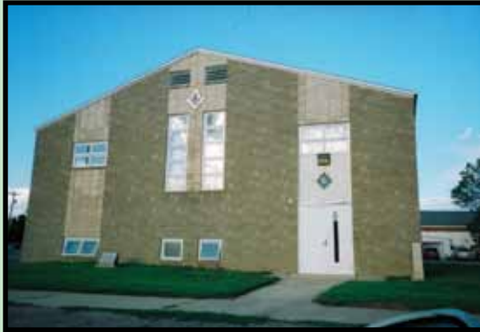
Spearfish #18, Spearfish, SD