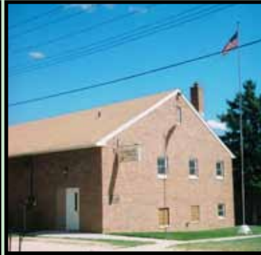
Custer City #66, Custer, SD