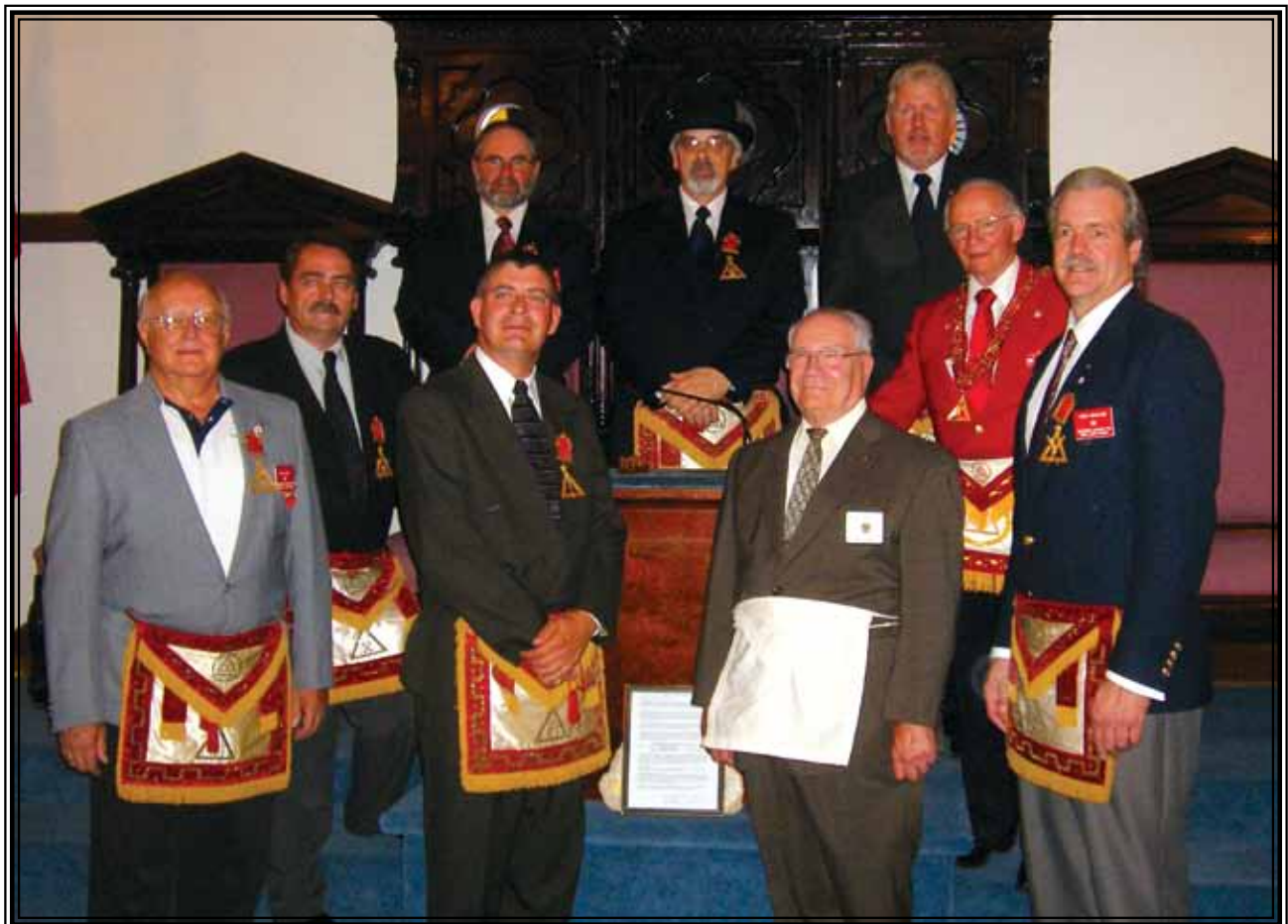
Officers of the Shekinah Chapter #52 of Royal Arch Masons are Installed at Anoka Lodge #30