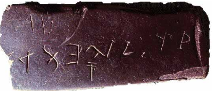
The Bat Creek Stone